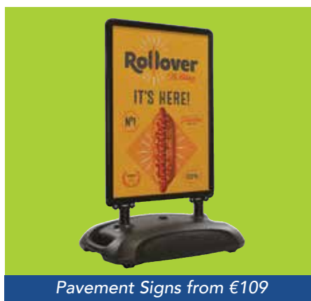
Pavement Signs from €109