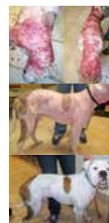
Dog with extensive skin injuries before and after laser treatment

Laser therapy is safe if performed correctly, using the proper settings and treatment durations. Laser beams directed at an eye can cause permanent retinal damage, so patients and all veterinary staff must wear protective goggles during treatment.