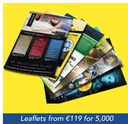
Leaflets from €119 for 5,000